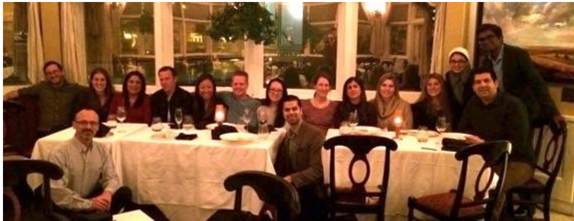
Pediatric Emergency Research Canada 2015

Our fellows have many opportunities to hone their skills as educators. Trainees are supported to attend formal courses through UBC, including the Residents as Teachers series. Other opportunities include teaching junior learners on shift, lecturing during PEM academic days, facilitating and developing simulation sessions, and supervising OSCEs for pediatric residents. For those who would like to pursue a career in medical education, UBC is home to the Centre for Health Education Scholarship ( http://ches.med.ubc.ca ).